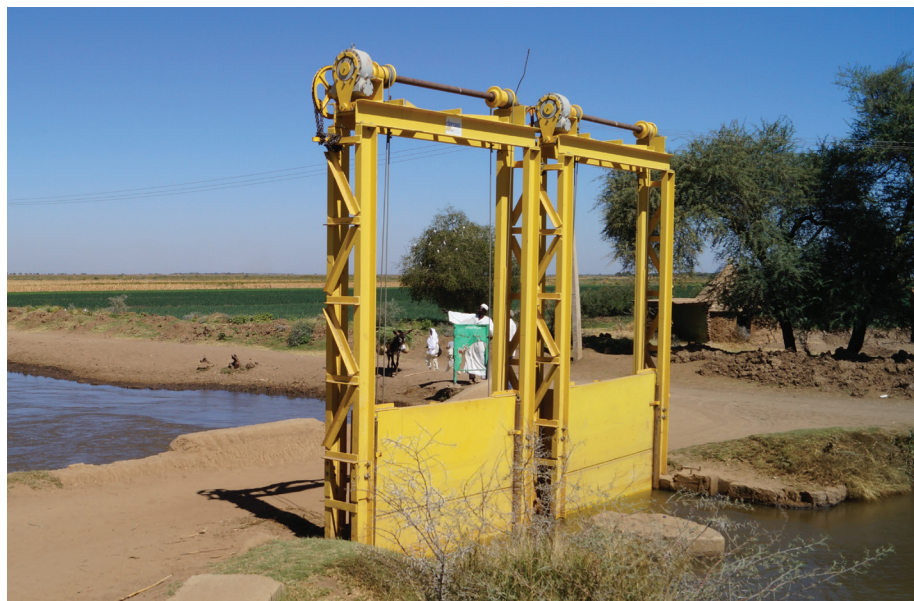
One of the major canals in the Gezira Irrigation Scheme in the east of Sudan.

"What's more, by continuing with the same irrigation pattern, there were