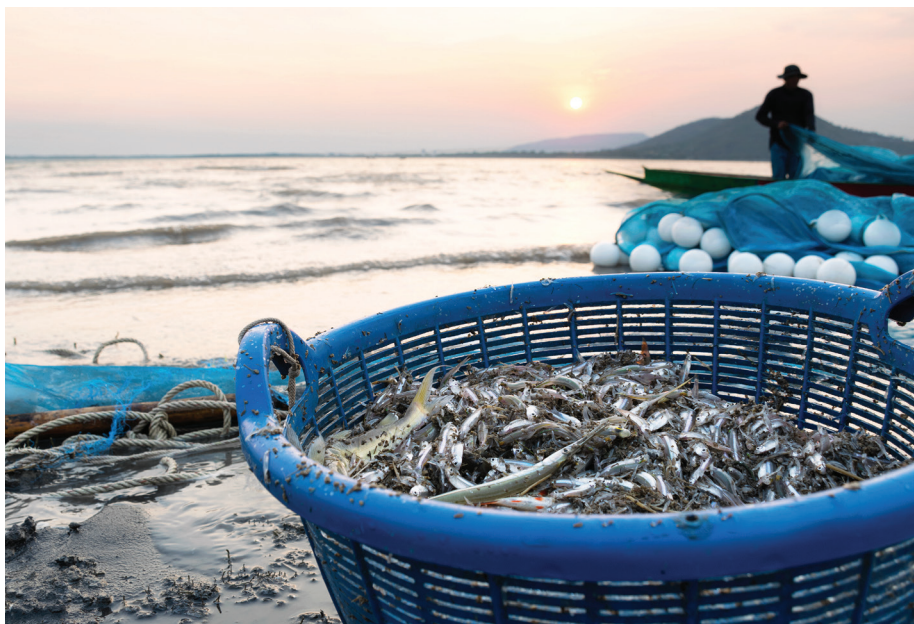
A fisherman secures a day's catch.

comes to an engagement platform design for Caribbean fishers. There are distinct and indigenous traits that could only be discovered and uncovered from living through the intended users' frustrations with, and reactions to, mFisheries."