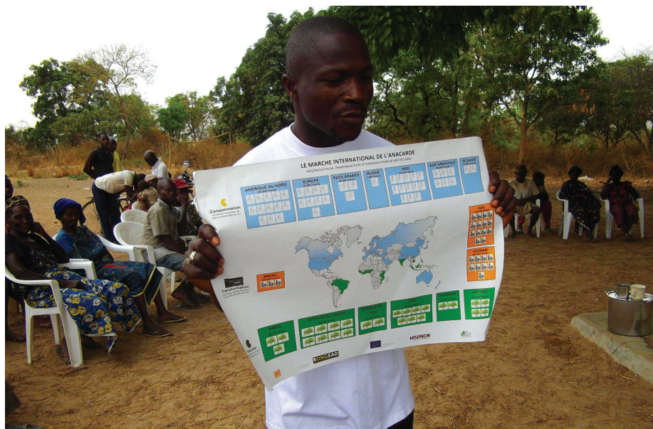
An N'Kalô trainer in action with local farmers