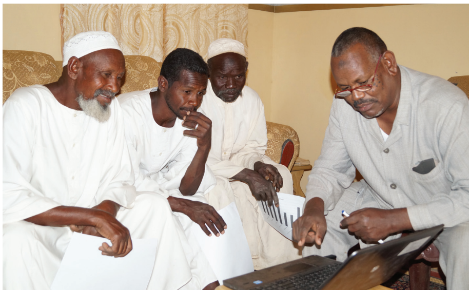
Farmers with land in the Gezira Irrigation Scheme in the east of Sudan are shown how satellite images can provide vital information on irrigation patterns for their farms, via eLEAF's SMS service.

eLEAF also works with the European Space Agency doing demonstration projects to raise awareness of Earth-observation services. Remco adds: