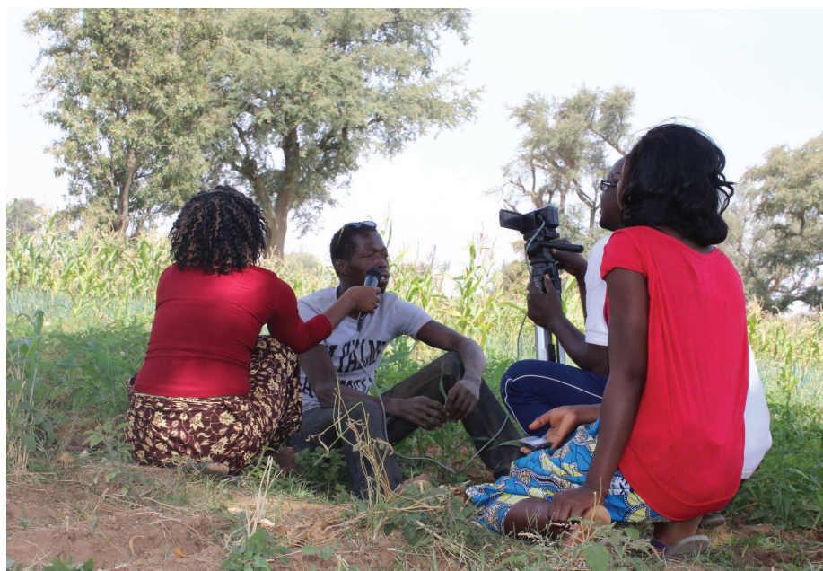
Farmers are filmed for an advocacy video.

“Burkina Faso must invest more in rice production but also in committing to buy locally grown rice. The country could save millions of dollars spent on imported rice, and could contribute to food security and combatting poverty, especially among rural women who are often involved in rice growing.”