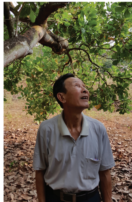
A farmer surveys his cashew trees in Côte d'Ivoire.