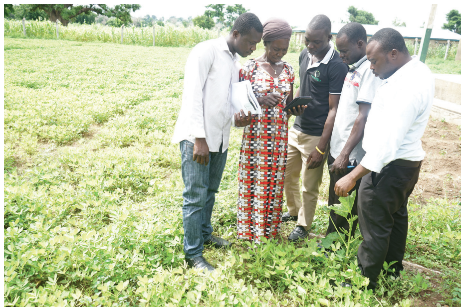
Farmerline provides hands-on training on their service.

"Many of the women are married, but it is well known that increasing the livelihoods of women will directly benefit the family and children, whereas if you target men with income-generating activities, the money is dissipated and is not used to support the family."