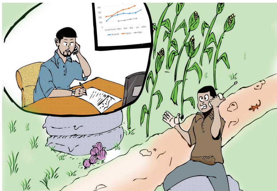
Cartoons are used to educate farmers about the benefits of the N’Kalô service

320,000 CFA Francs (€488) for a 2-hectare cashew farm.