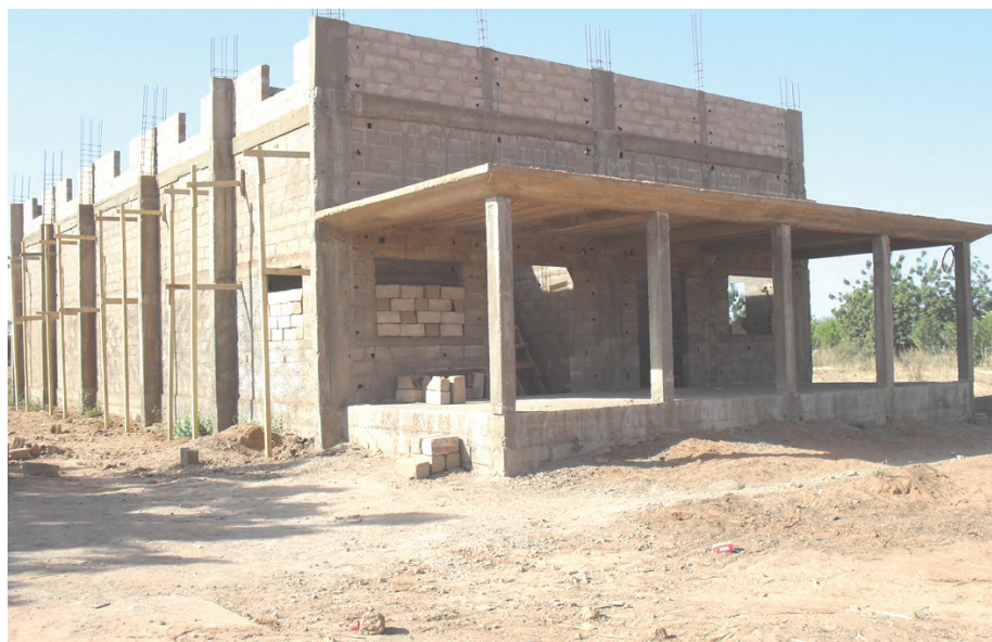
Shop for agricultural producers in Kongoussi, which is currently under construction. The building comprises a shop for growers to sell their produce, a second shop where growers can purchase seed treatment products and small farm equipment, and a meeting room for use by the FUMCOM-Bam management committee and members.

"Our advocacy on rice production touched thousands of people and put pressure on